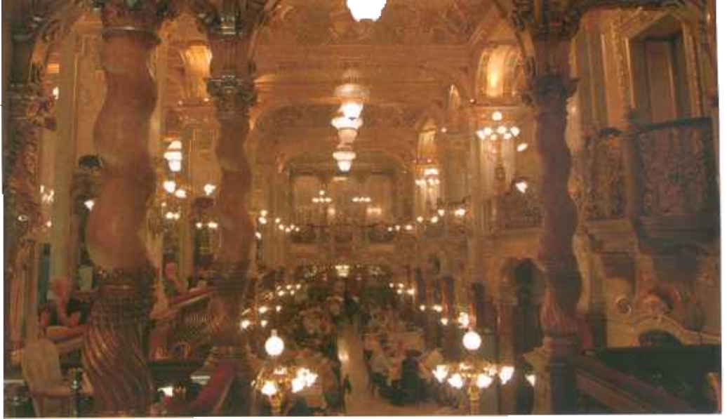
The New York Palace Hotel will open a conference centre and ice rink at the end of the year