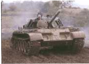
Try something different in this intriguing city

conference centre at the five-star New York Palace Hotel at the end of the year. It will feature an atrium piazza that will house a skating rink during winter. There will be seven event rooms accommodating 20 to 600 delegates.